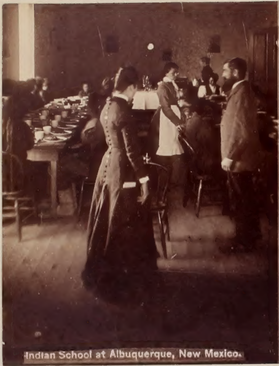
Indian School at Albuquerque, New Mexico.